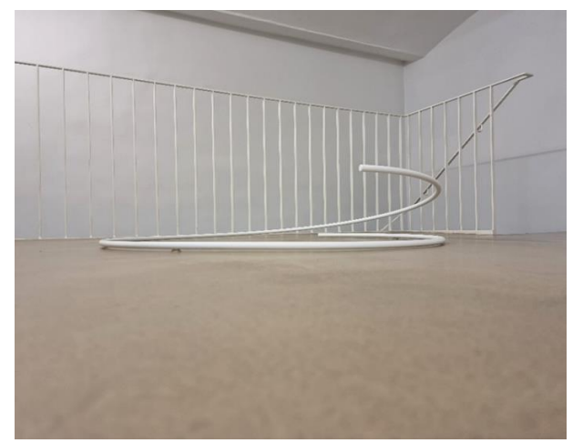
O.T. (KREIDEKREIS), 2021 room view: zsart Galerie, Wien

Information on Bildraum Bodensee image space: www.bildraum.bildrecht.at